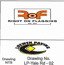
Figure # 7.8 in the TCMWR 2015 Edition Single Lane Alternating This Traffic Control Plan is designed to accommodate patch work on Kent Rd. There is only one trench line on Yale Rd to be re paved. Work to commence Wednesday, Aug. 8th, 2018 and is expected to be completed in one day, however permit will be requested for a week Work hours shall be from 7:00 am - 5:00 pm All signs and traffic devises shall be placed in compliance with WCB and the TCMWR